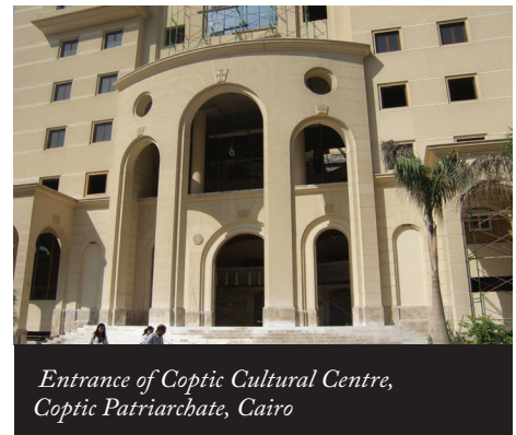
Entrance of Coptic Cultural Centre, Coptic Patriarchate, Cairo