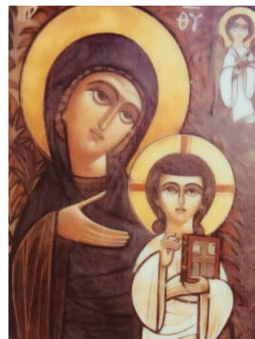
St. Mary and The Divine Child -1988