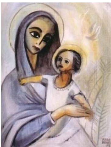
St. Mary and The Divine Child -1958