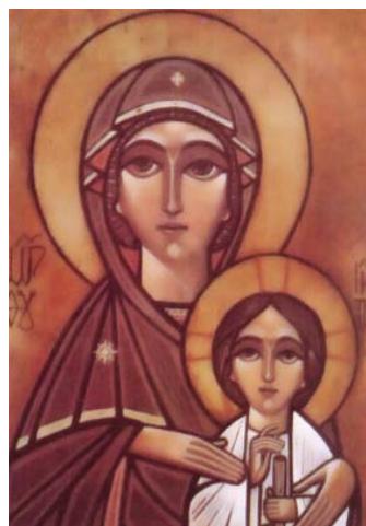
St. Mary and The Divine Child -1977